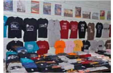
T-Shirts and books made the journey from North Carolina