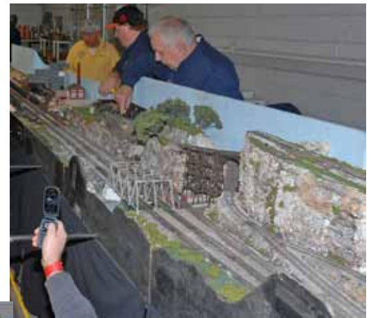
A couple of shots of the Division's modules. The coal train may or may not represent a record number of train cars on the modules - reports varied.