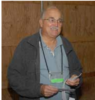
Winner from Neff Video